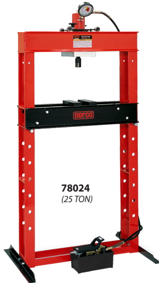
78024 (25 TON)

Straightening, bending & pressing. Removing and installing gears, bearings and bushings.